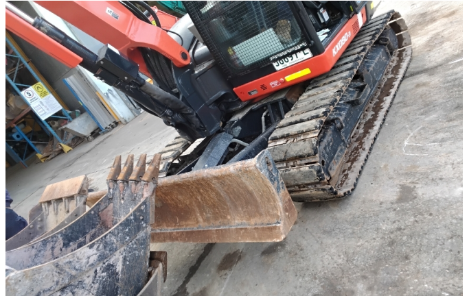
Tyre Condition 1