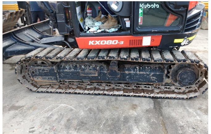
Tyre Condition 3