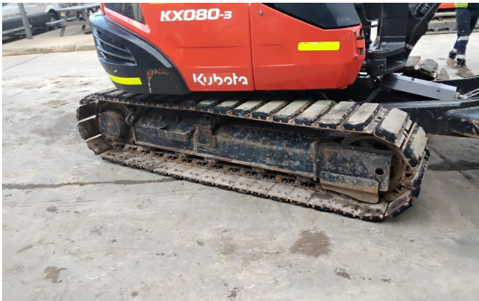
Tyre Condition 2